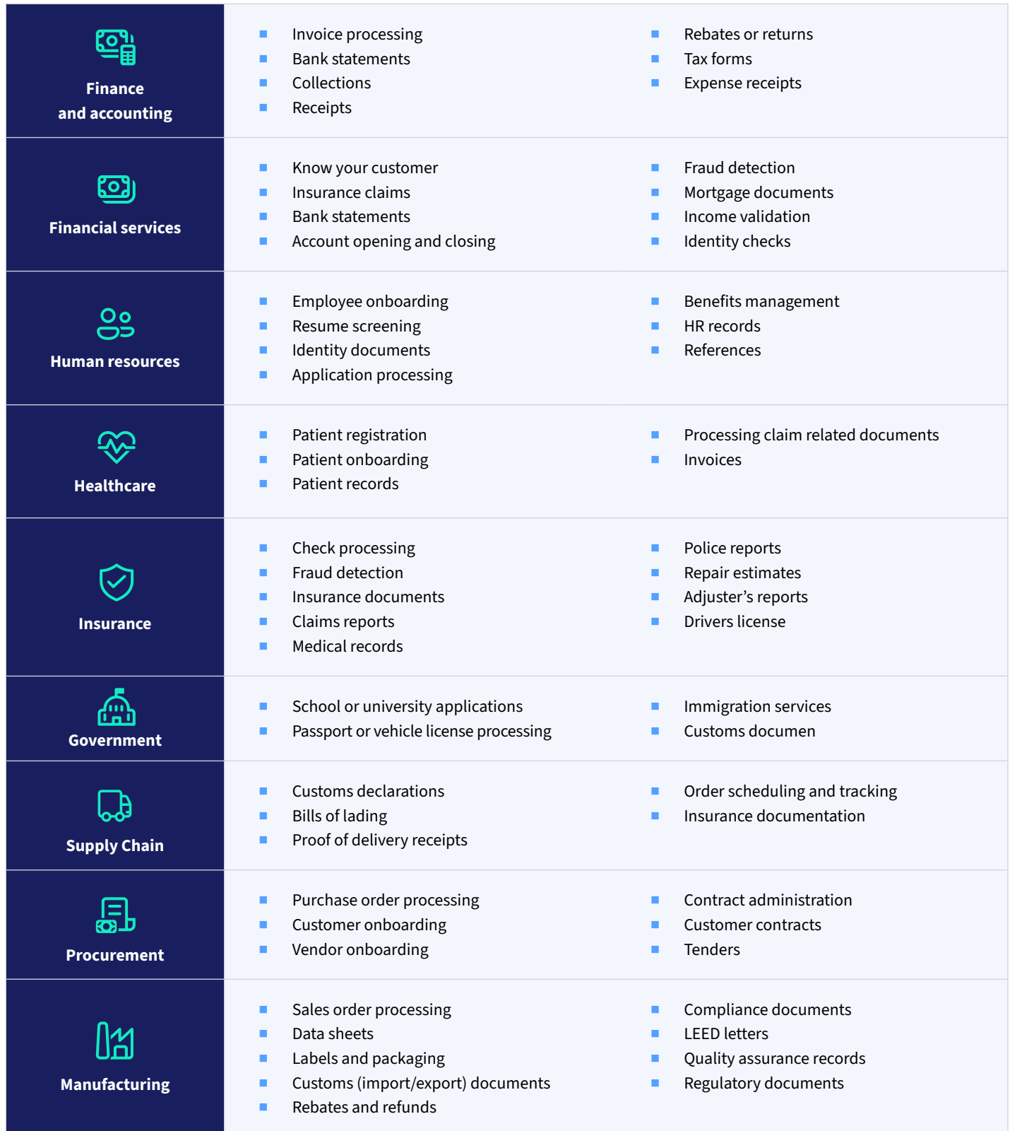
Table 1: Most common IDP use cases in an organization

In any organization, you will find a multitude of different document types and vast swathes of people struggling to meticulously process them with precision and speed. As a result, IDP has many potential use cases.